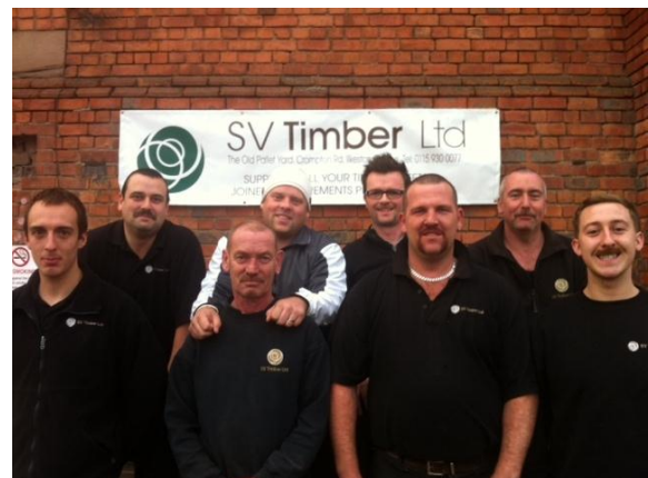
Near the end